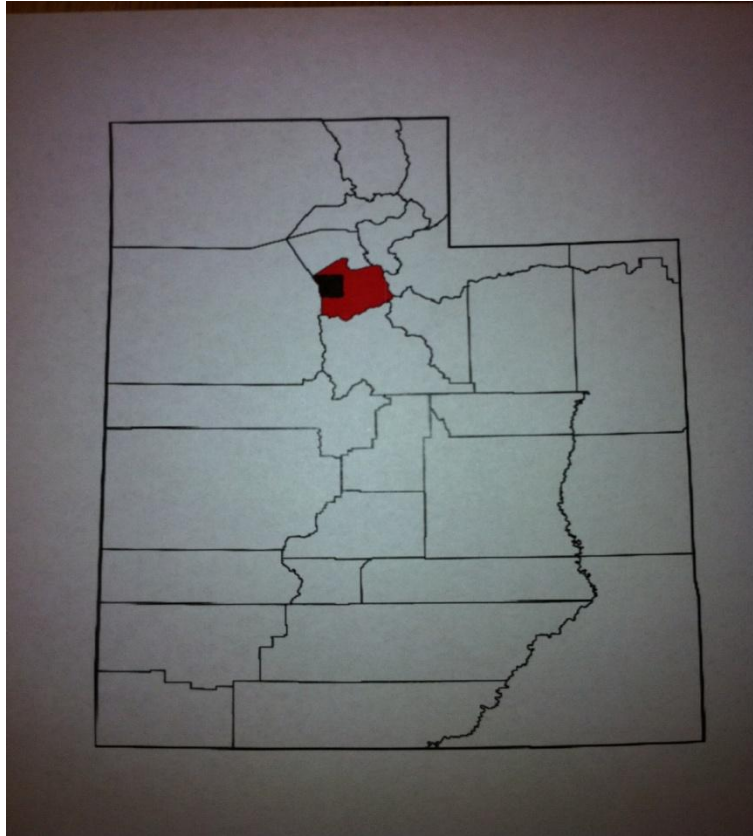
(Fig. 1, The State of Utah with Salt Lake County in red and Magna MAD in black.)