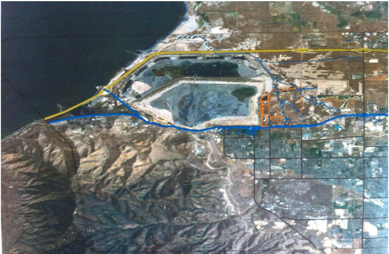
(Fig. 3. Magna District Border Map with Utah Waters shown.)